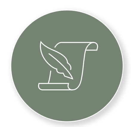
The Supplemental Charter of 27 January 1987. Page 4