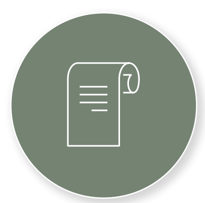
The Original Charter of 5 February 1912. Page 3